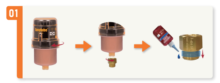
Follow steps 1 to 3 of installation method 1