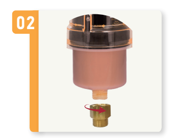
Install the sealing adapter on the grease cup