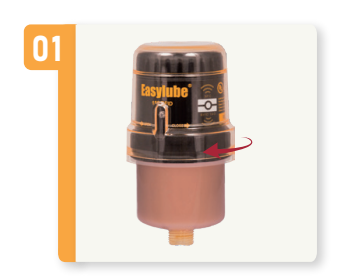
Assemble the drive unit and grease cup then lock tight