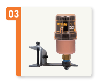
C-brackets can be subsequently installed