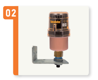
Install the sealing adapter to the L-bracket